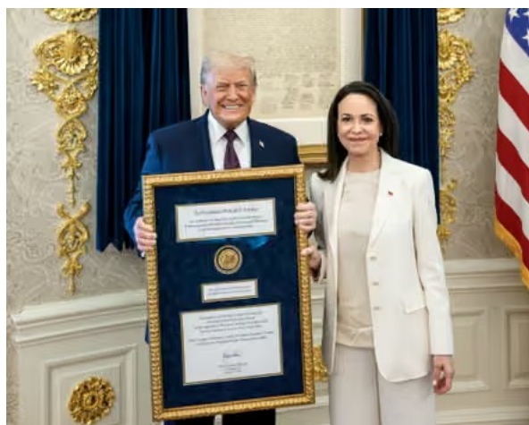
Peace Prize hand-over

In 2024 Machado won the primary for the presidential election against the dictator Nicolas Maduro, but she was then banned from standing in the election itself, which was widely claimed as rigged against Machado's party member who stood in her place..