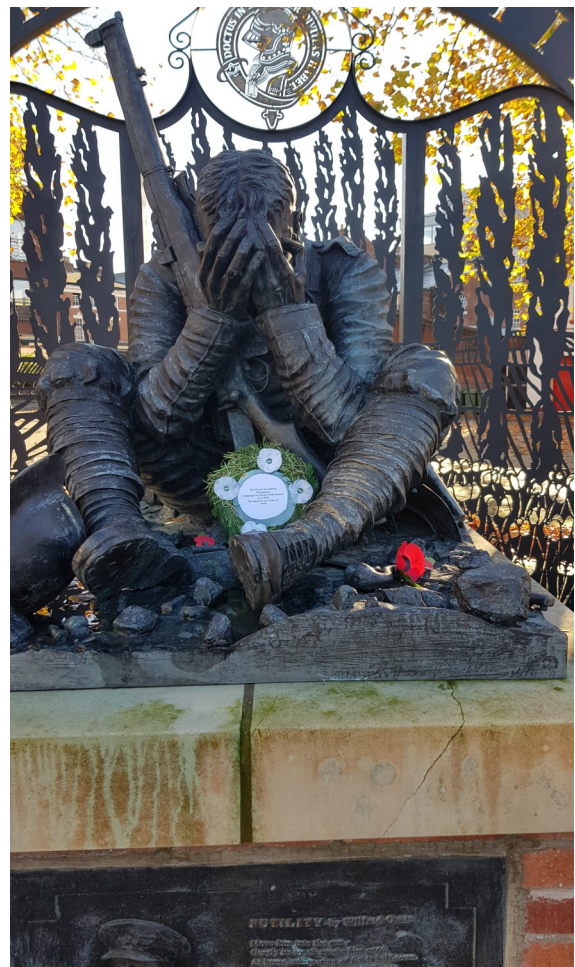
Wilfred Owen Memorial

"Why should the British government call me up and take me out to a battlefield to shoot a man I never knew, whose language I couldn't speak?".