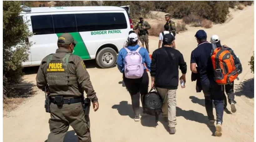
Round-up in US of migrants who've crossed the Mexican border

USA: On January 29, Trump signed an executive order to prepare a detention facility at Guantanamo Bay US naval base in Cuba to hold up to 30,000 migrants deported from the US. As Trump put it, justifying the order, “We have 30,000 beds in Guantanamo to detain the worst criminal illegal aliens threatening the American people.” He claimed the move would help eradicate “the scourge of migrant crime in our communities, once and for all.” He added that “Some of them are so bad we don’t even trust the countries [of origin] to hold them because we don’t want them coming back...so we’re going to send them out to Guantanamo.” So are they to be sent there for life?