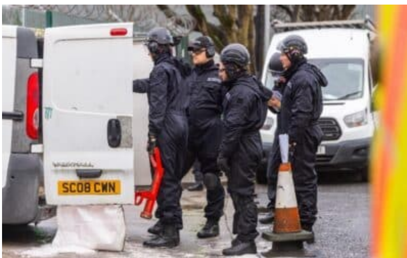
Police at back of van PA activists crashed into gates of Teledyne

January 23: Activists targeted Kelvinside Electronics in Glasgow, spraying the interior with red paint, and leaving signs that read: "Drop Leonardo Contract" and "Don't Profit from Genocide". Kelvinside offers services to both Leonardo and Thales, which firms supply arms to Israel.