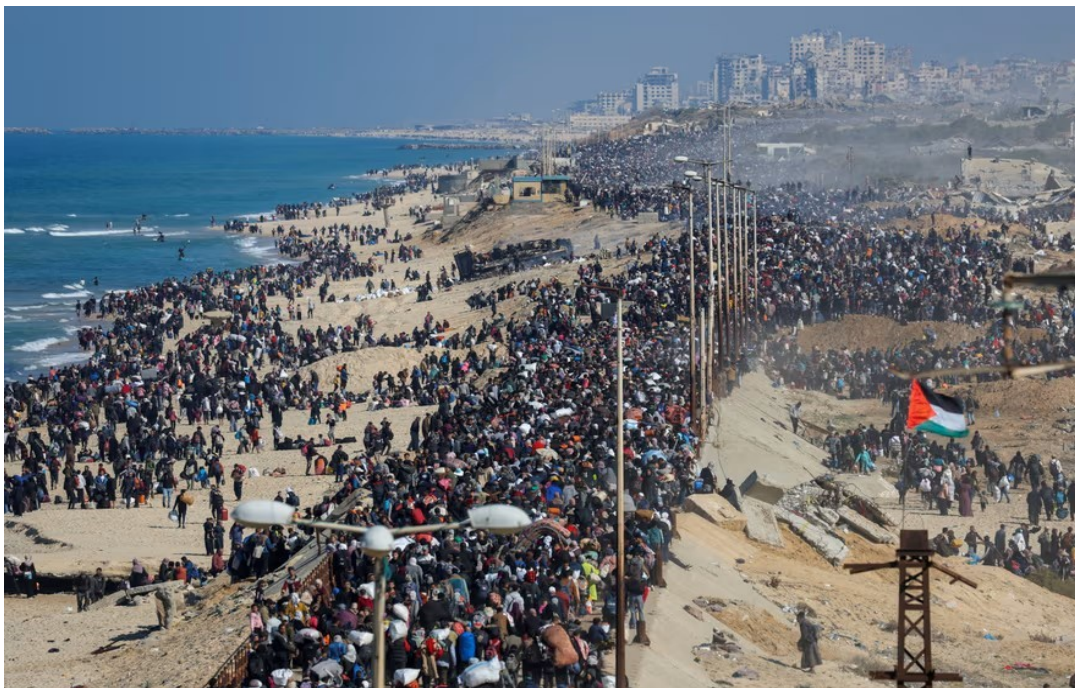
People returning to northern Gaza after the 2025 ceasefire

Why has Netanyahu agreed to a ceasefire now, when none of his war aims have been realised? His announced aims were to eliminate Hamas and free the hostages. Clearly he has not eliminated Hamas as shown by the number of armed fighters in Hamas uniforms shown supervising the release of hostages in Gaza. The Israeli paper Haaretz even suggested that Hamas has recruited nearly as many new members as were killed in the war. The second aim was undermined by the Israeli Defence Force's (IDF) heavy bombing of Gaza which must have killed many more hostages than the eight released by the IDF. A third