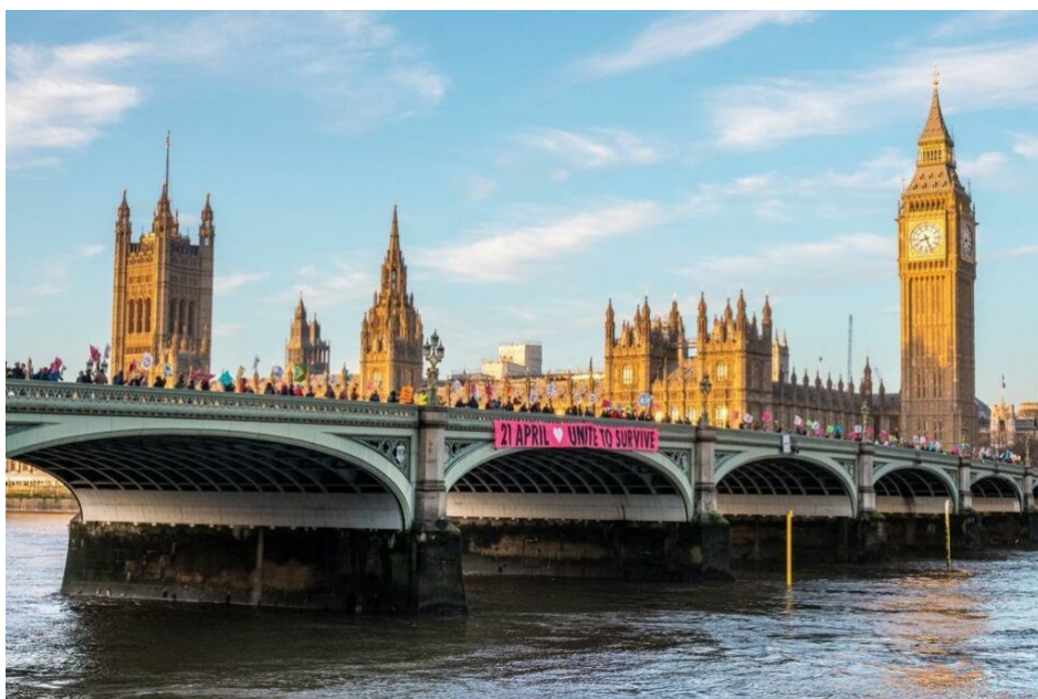
The banner drop with ER supporters on the bridge

10 days later, on January 11 th , ER announced its new campaign with a banner drop over Westminster Bridge. A group of activists marched from Jubilee Gardens to the bridge where they formed a human chain over it. The banner read: "21 April ♥ Unite to Survive"