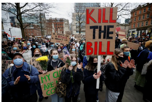
Kill the Bill march through Bristol March 2023

On 18 th November it was reported that Avon & Somerset police had paid undisclosed sums of damages to five people who claimed they had been assaulted by officers breaking up a “Kill the Bill” demonstration in Bristol on 23 rd March. The police did not admit liability, claiming their actions were