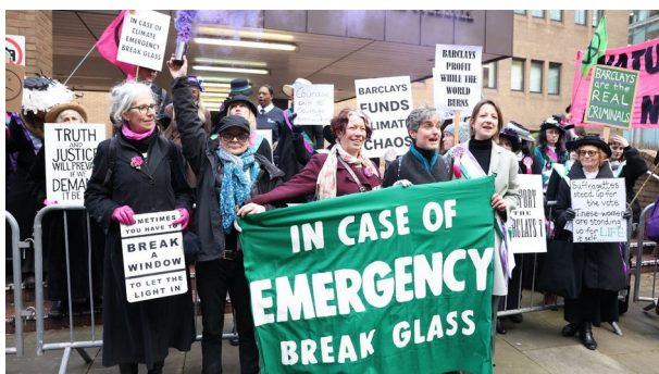
Supporters outside Southwark Crown Court