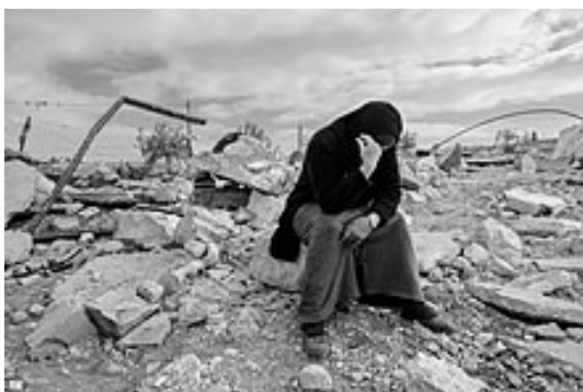
Woman sitting on the ruins of her demolished home in Masafer Yatta, January 2023

It was reported on January 14 th that Israeli Defence Force (IDF) soldiers had that day attacked Palestinians protesting against the stealing of Palestinian land in Masafer Yatta by a settler.