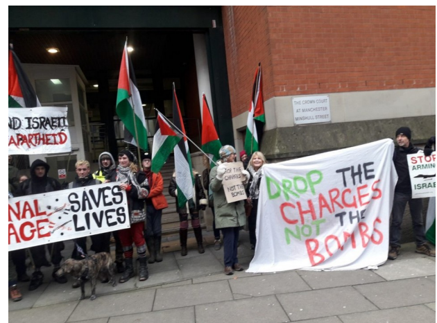
PA supporters outside Manchester Court, January 17 th

The two were the first to be charged with "criminal damage to a memorial" under the new Police, Crime and Sentencing Bill .