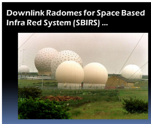
Image of Menwith Hill

Menwith Hill hosts three radomes in the US Space-Based Infrared System, part of US missile defense, 13 under the control of the US Space Force.