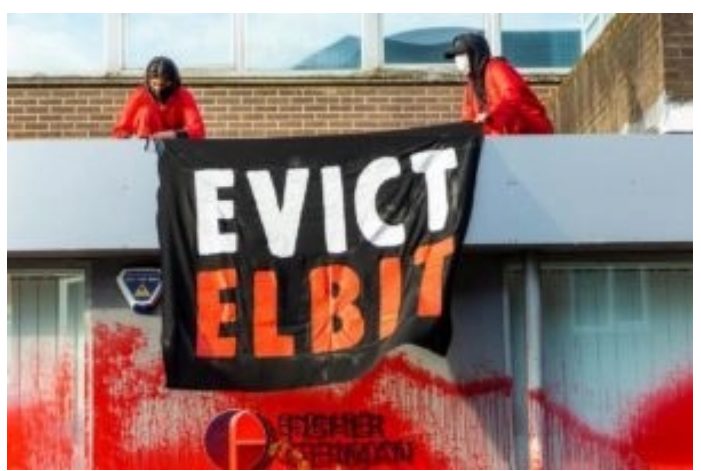
PA activists occupying the roof of the Fisher German offices prior their closing down

A new PA group, PA Scotland has recently been formed. Its first action was on June 1<sup>st</sup> when six activists occupying the roof of Thales's Glasgow factory. (Thales works with Elbit on drone projects.) The activists also destroyed factory equipment, causing workers to evacuate the factory. PA Scotland carried out a similar action at the factory on July 11<sup>th</sup>.