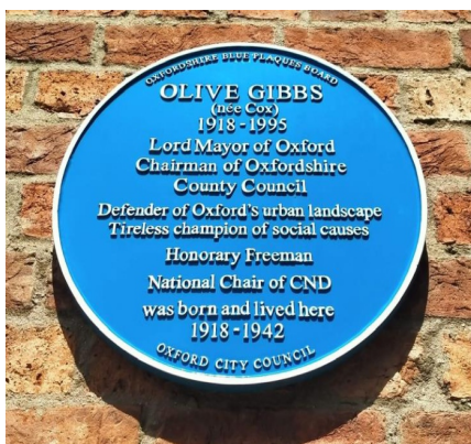
Olive Gibbs Plaque