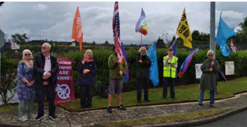
4 July Independence from the USA

The annual 4th July protest (started in the 1980s) included a presence outside Menwith Hill main gate. Thought-provoking, interesting speakers in the Zoom webinar included Alex Sobel MP, who continues to ask written parliamentary questions about the base's activities.