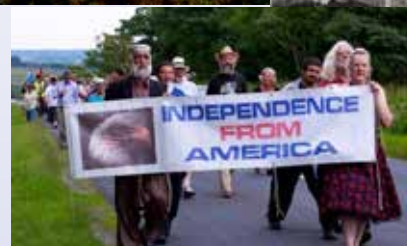
Supporters of Otley Peace Action Group in about 1983

Protest organised by the Campaign for the Accountability of American Bases calling for Independence from America on 4th July 2011