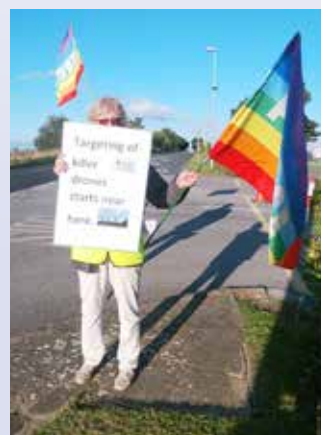
Protest 10 August 2021