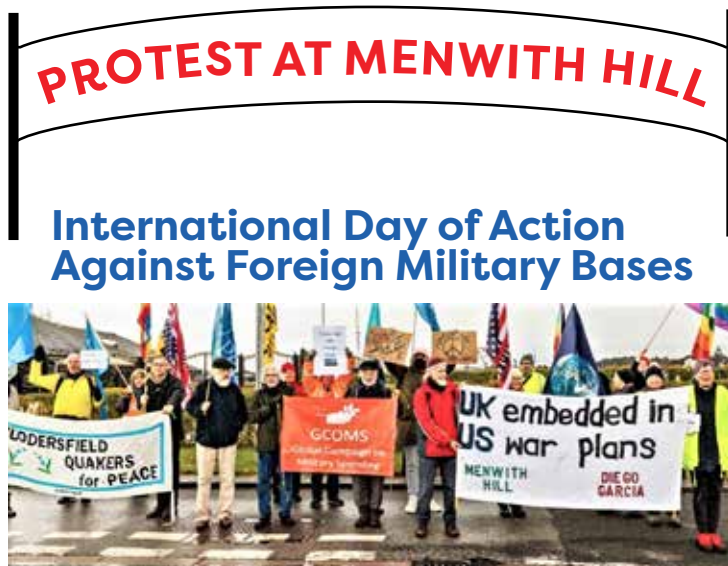
International Day of Action Against Foreign Military Bases

https://www.youtube.com/watch?v=8HScLY93Aas