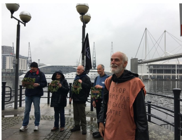
Four Veterans for Peace holding the four wreaths before dropping them in the dock (ExCeL on the right.)

On the 15 th , STAF unfurled two giant banners down a disused building opposite ExCeL, in solidarity with Palestine and all at DSEI who profit from death, at the same time as delegates at DSEI were watching a military boat display.