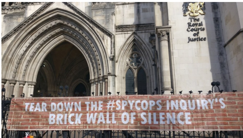
Banner outside High Court where inquiry was in progress in 2019