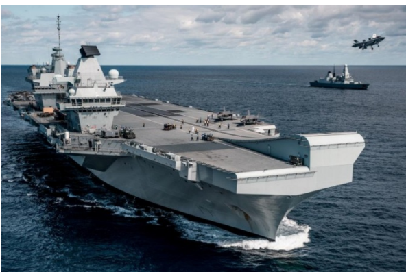
Ruling the Waves? UK aircraft carrier HMS Queen Elizabeth is being deployed in the Pacific.

A joint statement by the three leaders said the deal will "sustain peace and stability in the Indo-Pacific region".