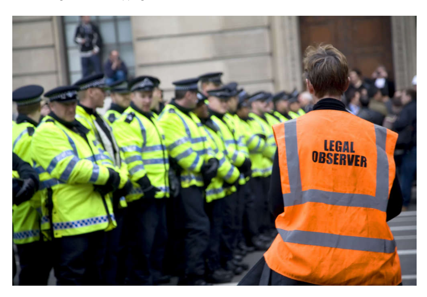
Green and Black Cross legal observer monitoring policing of a protest in London.

In 2015, legal observers travelling from a Stop NATO peace camp o an anti war demonstration in Newport were pulled over by police and searched based on grounds without any apparent reasonable grounds for stopping them.<sup>53</sup>