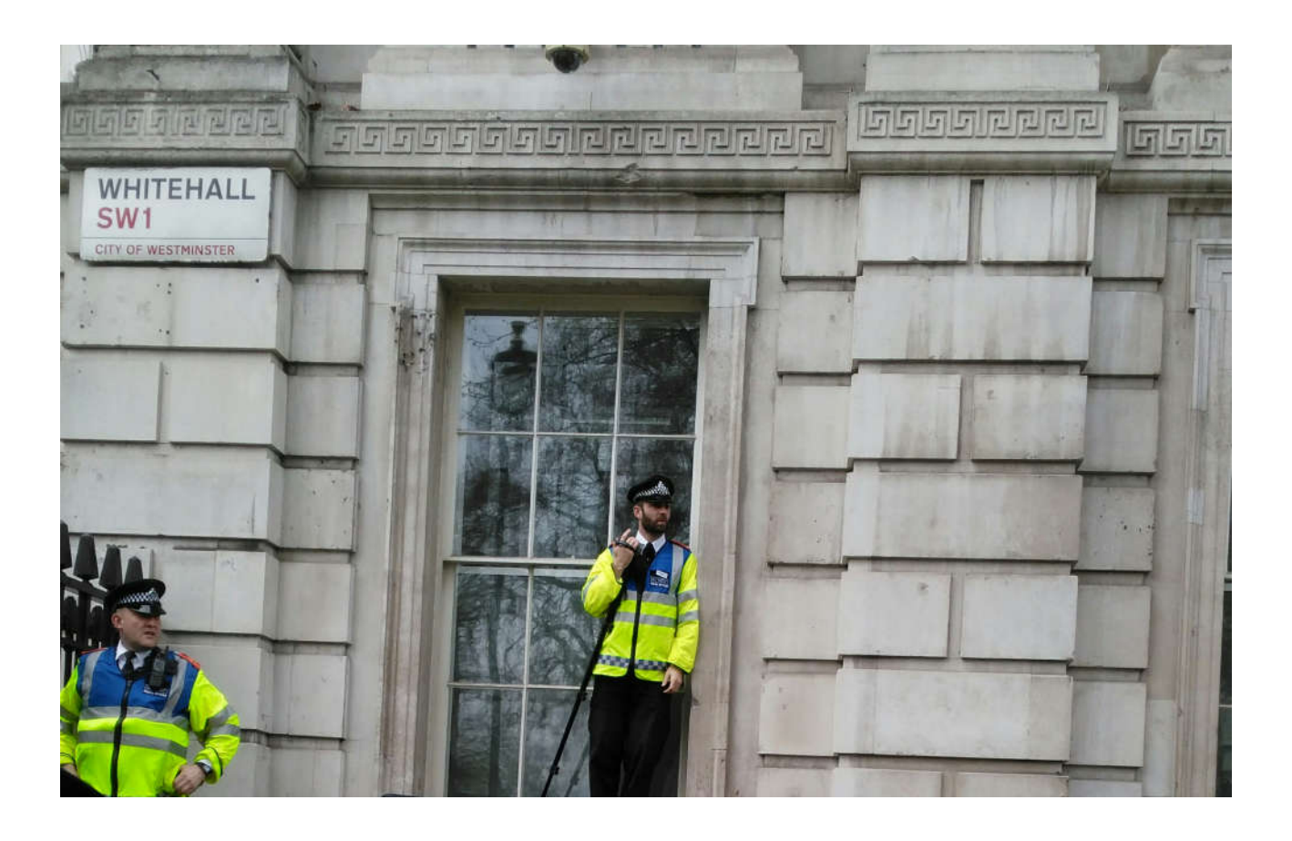
Policing filming a protest in Whitehall in London in 2016.

Too often, requests for details about the operations of these units are rejected using the "law enforcement" or "national security" exemptions of the Freedom of Information Act and there is little clarity about how police classify risk – a situation that is unlikely to change as long as thee policing of protest is entangled from the policing of counter-terrorism.