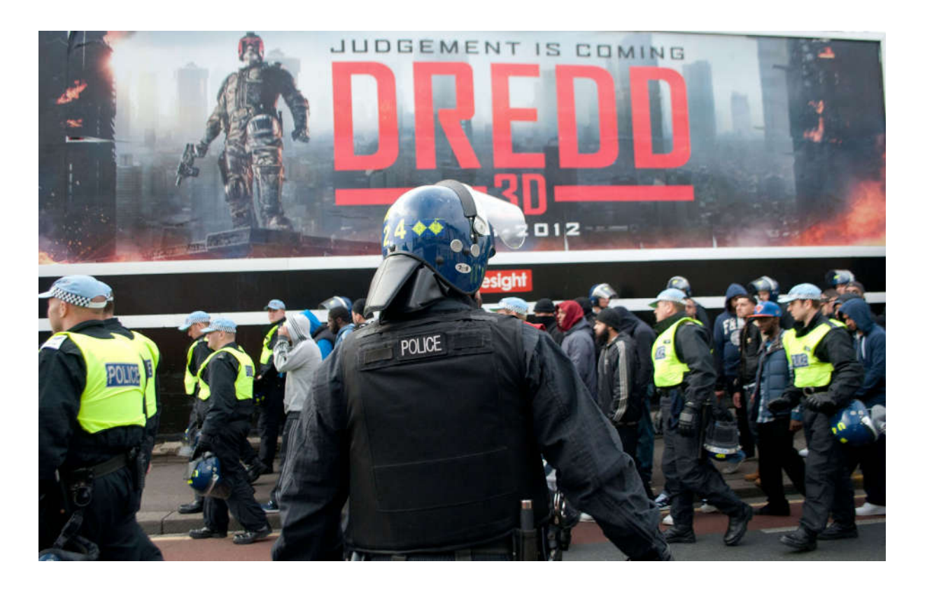
Policing kettling anti-fascist protesters in Walthamstow, 2012.

An assembly that remains peaceful while nevertheless causing a high level of disruption, such as the extended blocking of traffic, may be dispersed, as a rule, only if the disruption is "serious and sustained".