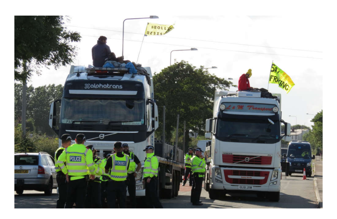
Protest in Lancashire that led to the arrest of the 'Frack Free Four', 2017.

In June 2016, nine defendants arrested for obstructing the highway at Horse Hill were found not-guilty at a trial where a district judge expressed concerns about the "deteriorating relationship between police and protesters". He noted that the police "did not reach an accommodation to allow the protests to proceed in a manner that did not require arrests."<sup>21</sup>